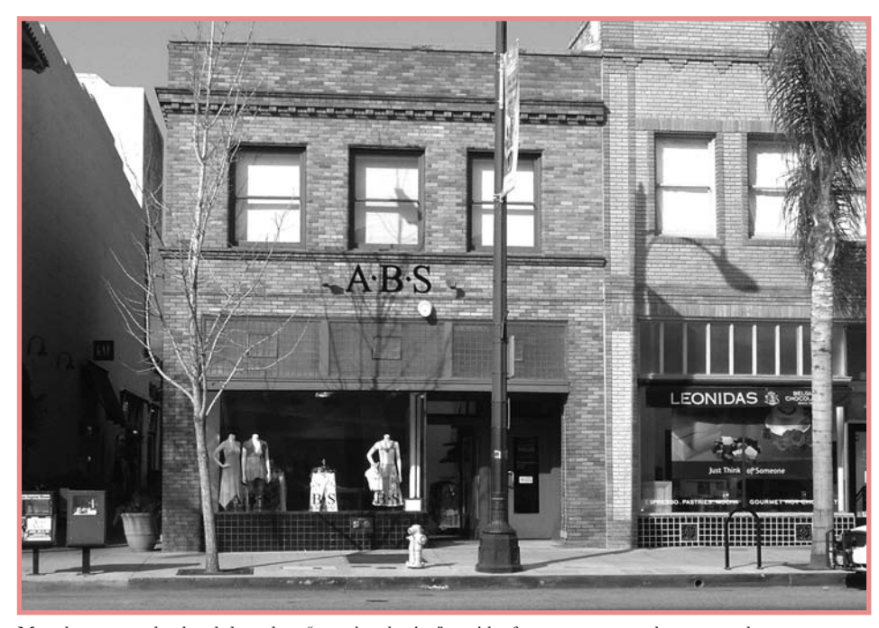
Most\ downtowns\ developed\ through\ an\ "organic\ urbanism"\ outside\ of\ contemporary\ regulatory\ controls.