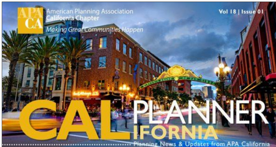
CAL PLANNER IMAGE