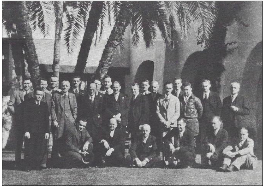
AIP CALCHAPTER NEWSLETTER