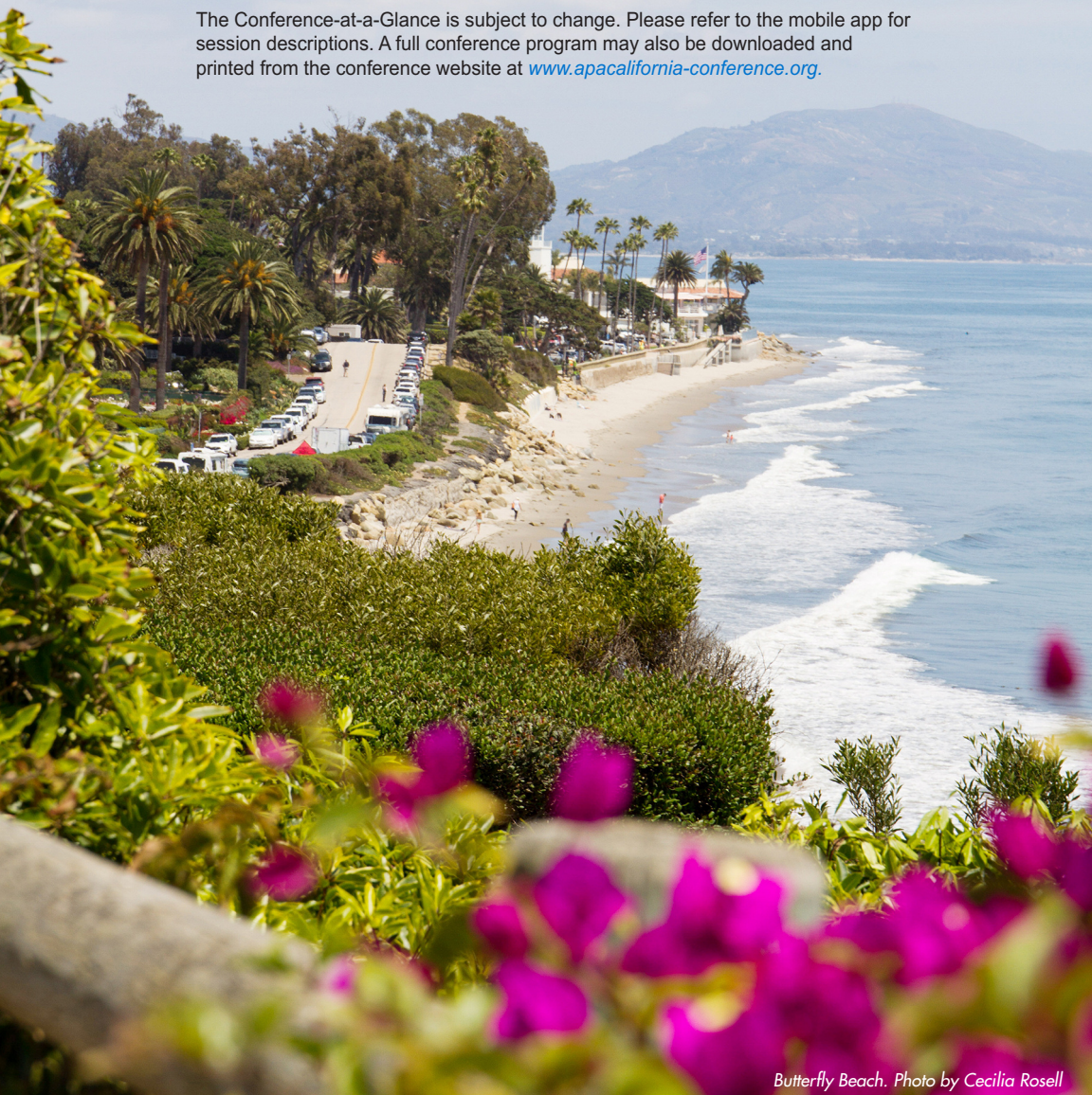
Butterfly Beach.

The Conference-at-a-Glance is subject to change. Please refer to the mobile app for session descriptions. A full conference program may also be downloaded and printed from the conference website at www.apacalifornia-conference.org .