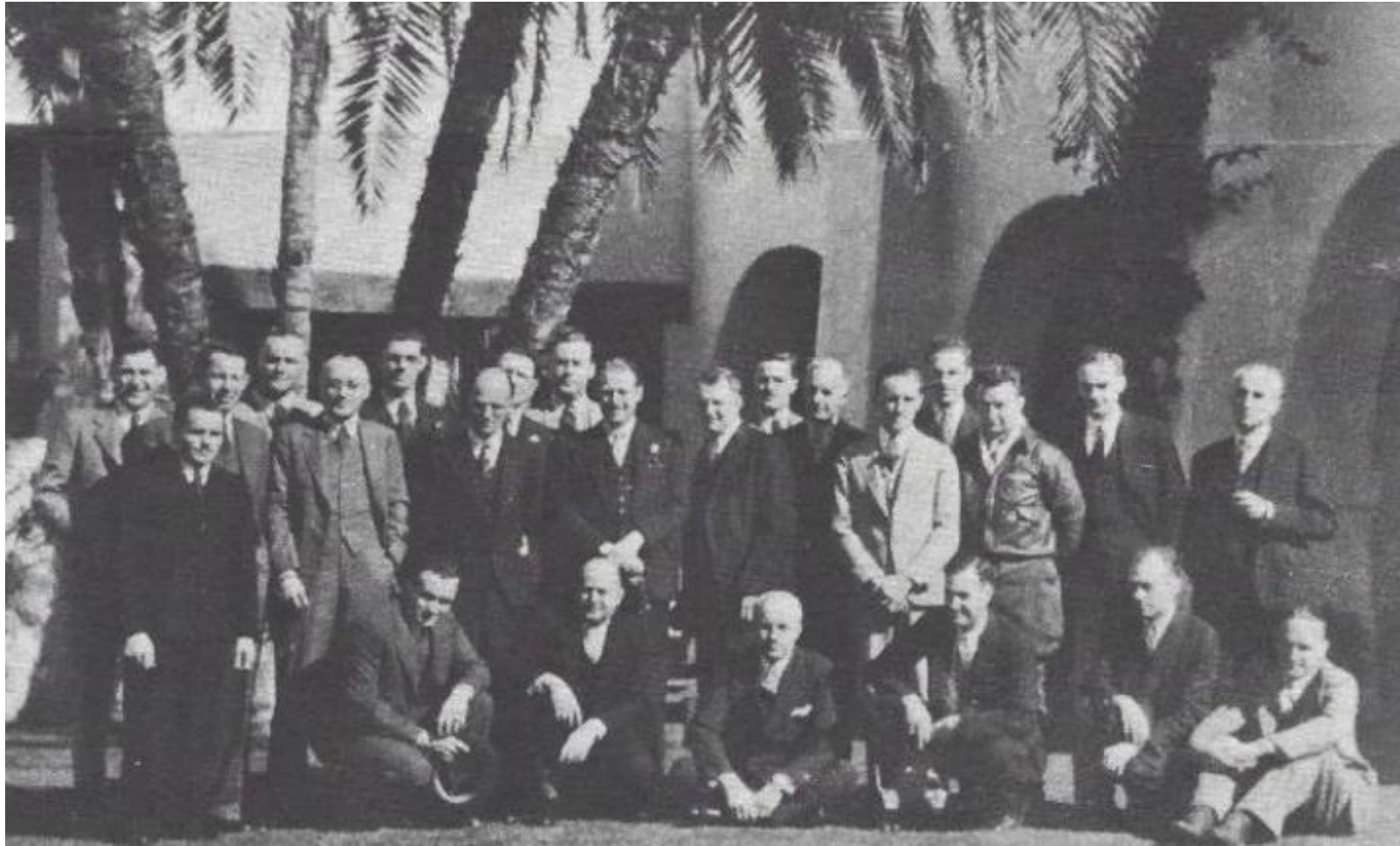
Members of the California Planners Institute (CPI), forerunner of APA California, attendees at 1934 annual meeting at the Hotel Del Monte, Monterey. The largely white, male registrants represented both the state's forward-thinking cities and prominent consulting firms.